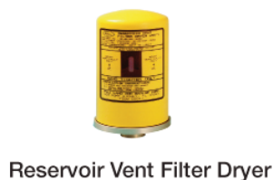
Reservoir Vent Filter Dryer

Discharge Filter Element Spin-on Replacement Instructions found on pg. 14 of Manual PLM-TM-97059*