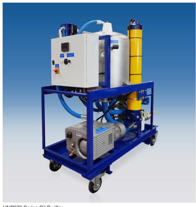
HNP076 Series Oil Purifier

Water removal rates are affected by the fluid viscosity, temperature, form of water (free or dissolved) and the amount of water present. Pall utilizes a well defined and repeatable test procedure that ensures thorough dispersion of the water in the test fluid initially and throughout the test. The water removal rate shown is for tests with ISO VG 32 mineral based turbine lube oil at 60 ^\circ\text{C} in the range of 2.6 % to 1.4 %water. The removal rates at higher water concentrations will be significantly higher.